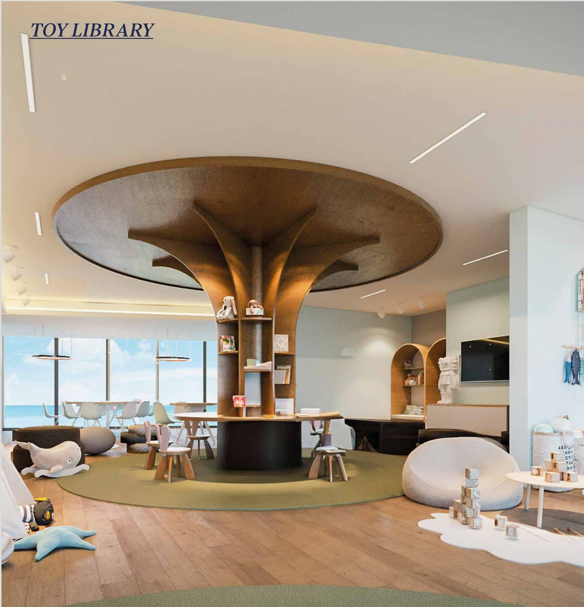
COZUMEL | QUINTANA ROO